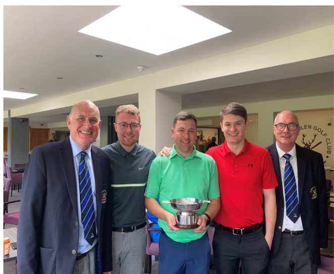
The Prize-winners with the GGU Exec